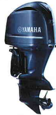
F350TXR / LF350TXR